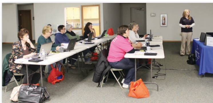
The first computer class was held at the Grand Electric Social Room in Bison.