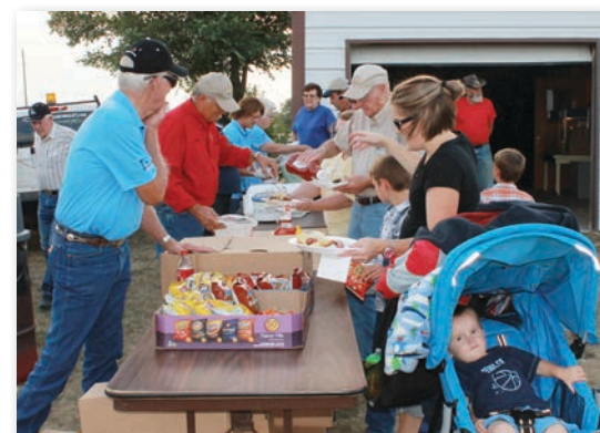
Tailgate party in Buffalo.