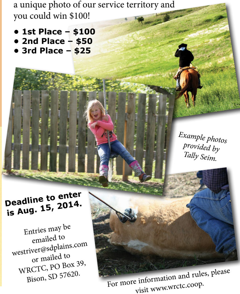
Example photos.