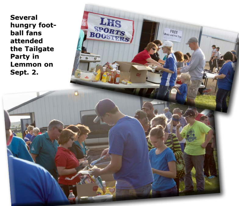
Several hungry football fans attended the Tailgate Party in Lemmon on Sept. 2.

However, the fun didn't stop there! We continued right into fall with our Tailgate Parties! We served brats and hot dogs to several hungry football fans in Buffalo, Bison, Lemmon, Newell and Faith during the months of August and September.