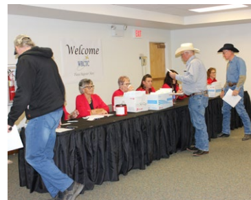
Members register with the Member Relations Reps.