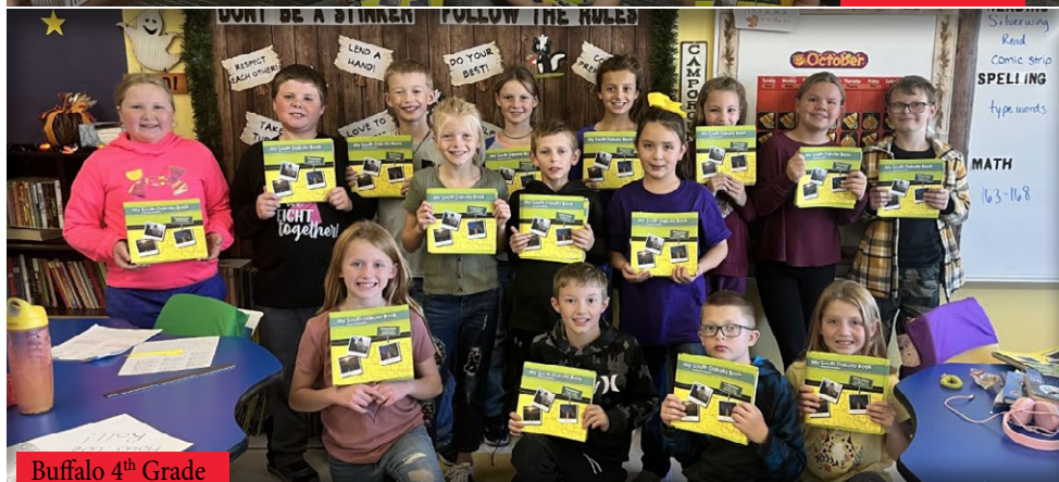
Buffalo 4 th Grade

Not Pictured: Lemmon 4th Grade and Newell 4th Grade