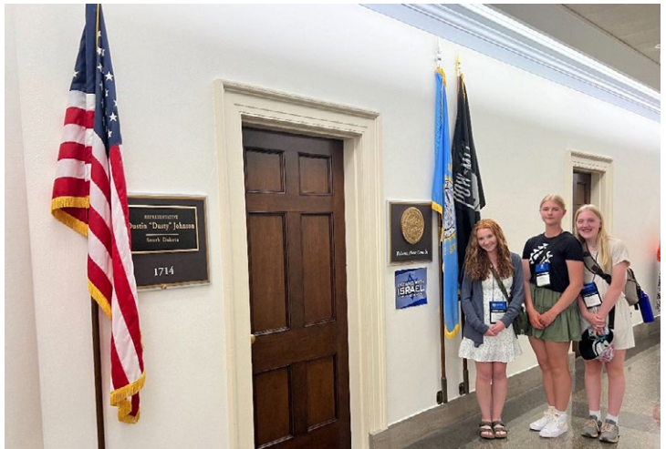
Youth Tour participants pose by the South Dakota flag just outside of House Rep. Dusty Johnson's office.

WRCTC is closed, Thursday, July 4, 2024, in observance of Independence Day.