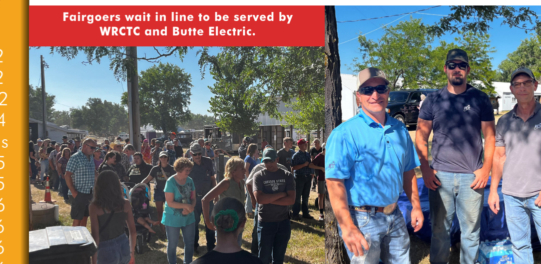
Fairgoers wait in line to be served by WRCTC and Butte Electric.

It was an extremely hot day, but that didn't slow down fairgoers! A little over 1,000 people were served on Thursday evening. It's incredibly rewarding working with another Cooperative 206 6th St. E Apt #18, Lemmon; to host a fun event for our members! Thank you to all who attended!